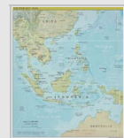
PHYSICAL SOUTHEAST ASIA JPG (401KB) PDF (441KB)