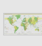
STANDARD TIME ZONES OF THE WORLD JPG (322KB) PDF (868KB)