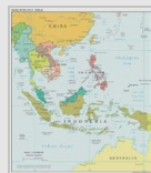
POLITICAL SOUTHEAST ASIA JPG (307KB) PDF (2042KB)